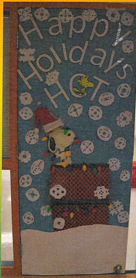
Health Career Technology