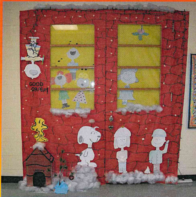
1st place, Dental Assistant