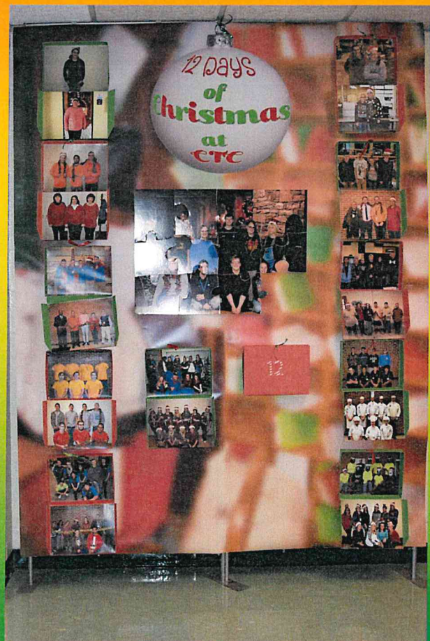
Commercial Art & Design