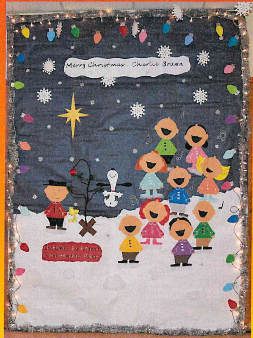
2nd place, Cosmetology