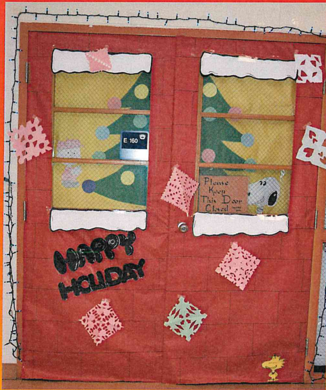
5th place , Medical Assistant

Each program received points toward Shop of the Year based on the 1st place (highest 20 points) to 5th place (14 points). Participation points (10 points) were awarded to the following programs: