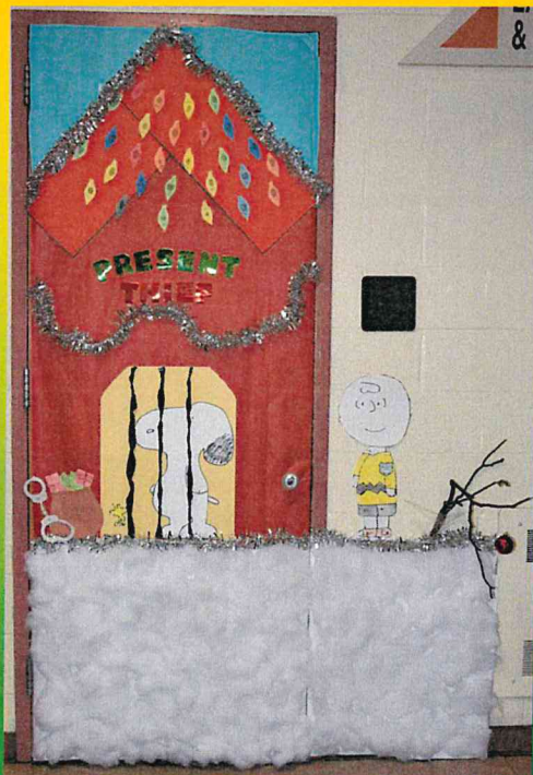
3rd place, Law Enforcement