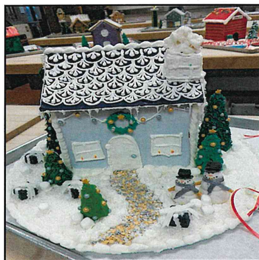
4th Place—Kayleen Weaber—LH