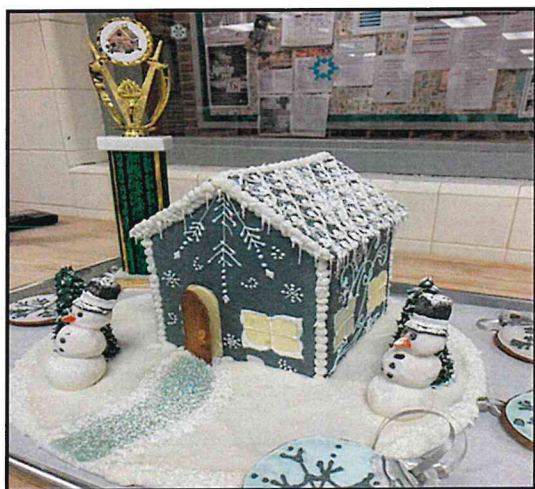
1st Place—Lani Fleck— CL