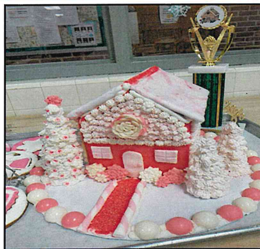
2nd Place—Ari'Shay Allendes—LH