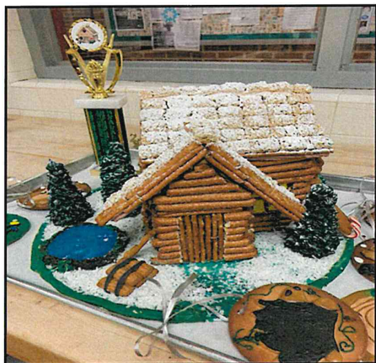
3rd Place—Beth Eisenhauer—CL