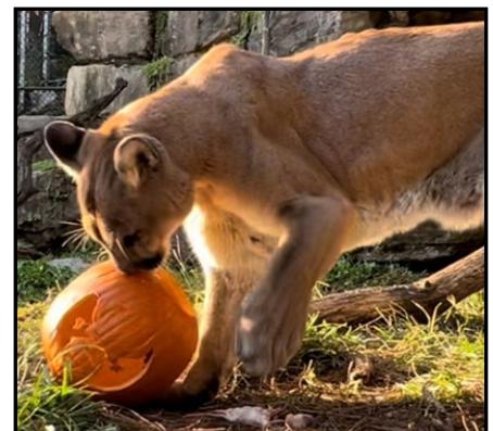
The mountain lion at ZooAmerica.