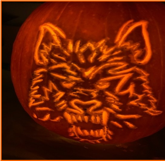
Emme Fischer-1st place