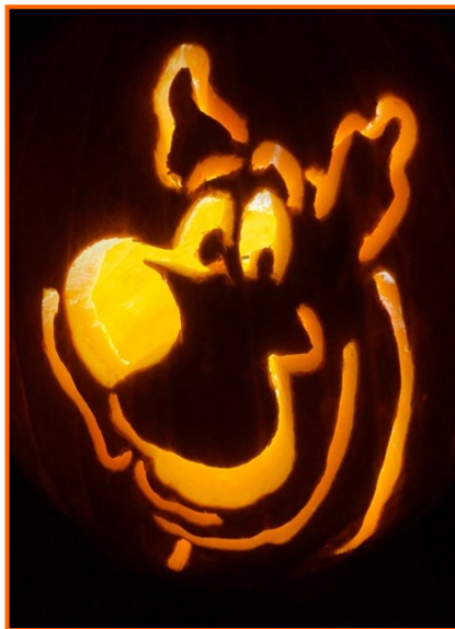
Paige Smith-3rd place