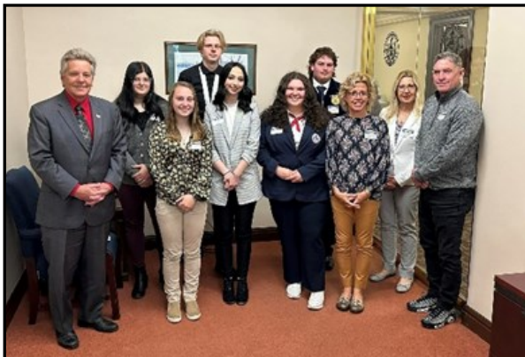
Rep. Russ Diamond